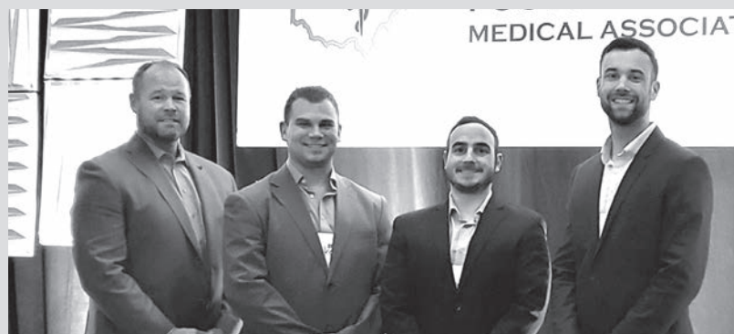
2022 Resident Poster Competition Finalists: